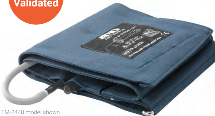
TM-2440 model shown. The TM-2440 & TM-2441 ABPM are portable and lightweight units with a carrying case that can attach to a belt (included).