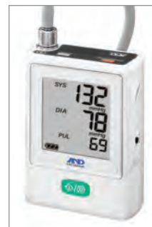
TM-2441 monitor with additional functionality.

This new ABPM range was validated in accordance with the new ISO810601-2 protocol, and the blood pressure accuracy was proven to be +/-3mmHg.